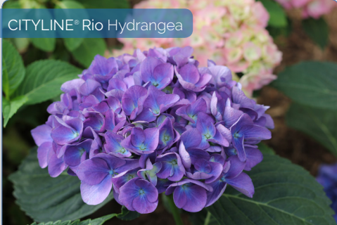
CITYLINE® Rio Hydrangea

Hydrangea Fun Fact There are about 49 species of hydrangeas. Four species are native to North America, including smooth hydrangea and oakleaf hydrangea.