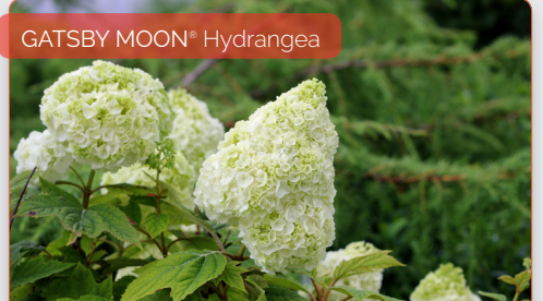
GATSBY MOON® Hydrangea

Proven Winners® varieties: TUFF STUFF™ series