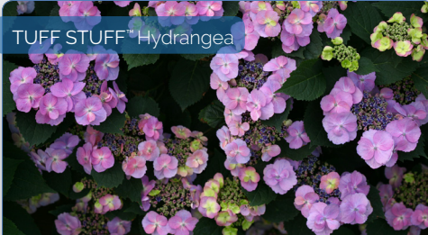
TUFF STUFF® Hydrangea